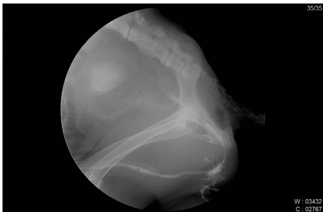
Figure 1: Positive contrast retrograde urethrogram preoperative

ensure no iatrogenic trauma to the vascular supply of the tunica. The incision from the caudal aspect of the scrotal ablation was then extended caudo-dorsally to the perineum over the root of the penis. The dog was catheterised through the prepuce and ostium of the penis with an 8FG sterile feeding tube. Placing the catheter facilitated identification of the urethra and the urethral mucosal defect. There was complete loss of the urethral mucosa that made up the roof of the urethra just distal to the penile root. There was a thin strip of mucosa on the cranial aspect of the urethra, making up the urethral floor. There were marked fibrous adhesions to the ishiocavernosus and bulbospongiosus muscles to the point that it was not possible to differentiate them from one another. The urinary catheter facilitated identification of the remaining urethral mucosa and the removal of the fibrous tissue. A vascularised strip of the tunica, 5 mm in width, and covering the entire defect was identified (Figure 2). The strip of tunic was sutured onto the dorsal aspect of the mucosa with simple interrupted 6-0 PDS (MonoPlus 6/0, B Braun surgical, Rubi, Spain) sutures replacing the mucosal defect, taking care to protect the blood supply (Figure 2.) onto the urethral defect.