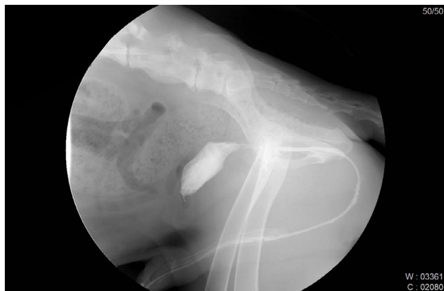
Figure 3: Two weeks postoperative retrograde positive contrast urethrogram

Prior to closure, tissue samples from the perineum were taken for histopathology and culture. Closure was routine with a subcutaneous continuous suture pattern using 4/0 polyglyconate (Monosyn 4/0, B Braun surgical, Rubi, Spain) and a simple interrupted suture pattern using nylon 4-0 (Nylon 4/0, Gabler medical, Essex, United Kingdom) to close the skin.